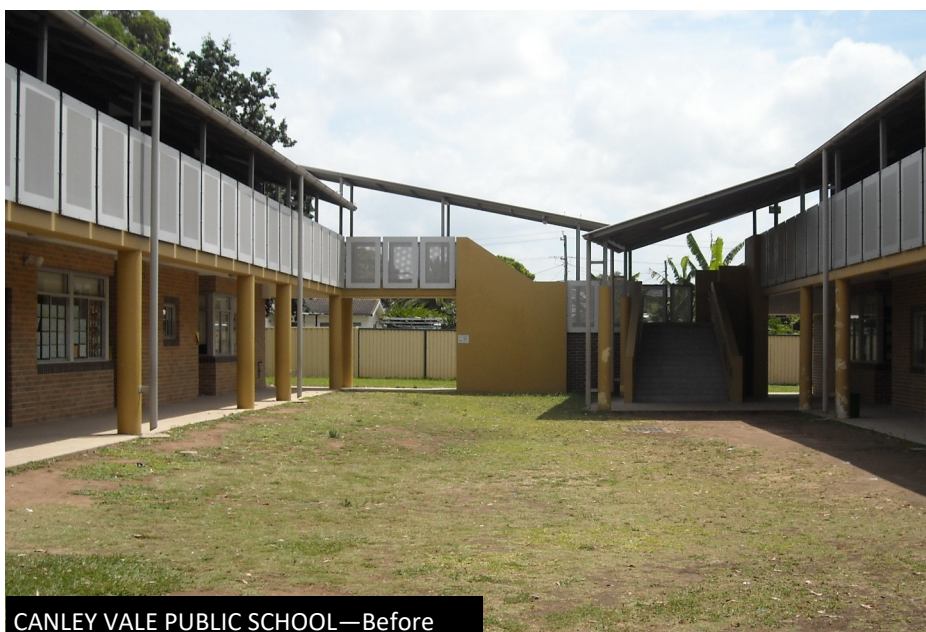
CANLEY VALE PUBLIC SCHOOL—Before