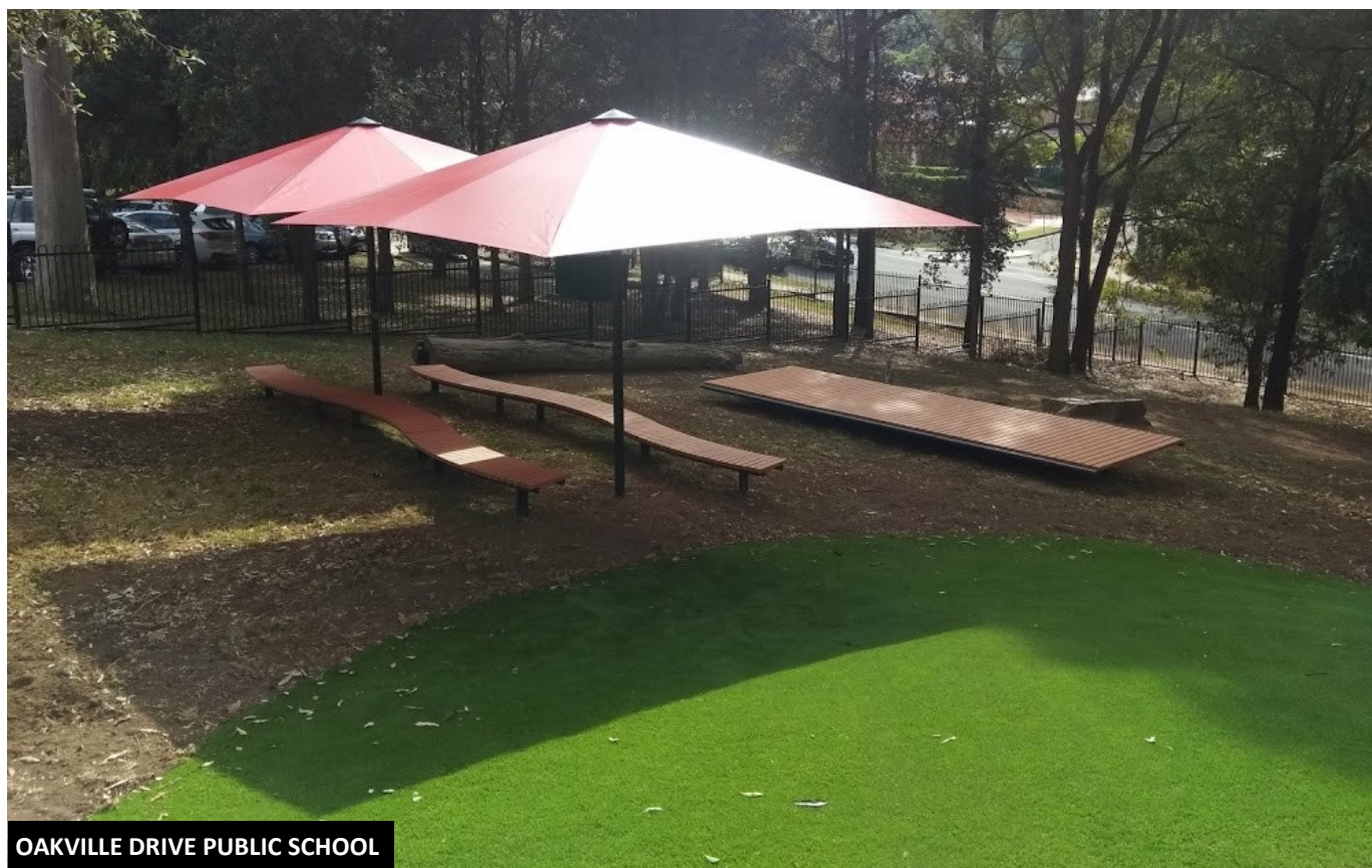
OAKVILLE DRIVE PUBLIC SCHOOL

Our design team is expert in designing and creating useful and enjoyable spaces from existing unused and unattractive spaces.